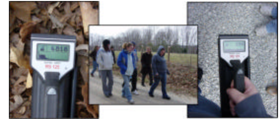
Readings on Scintillator of Uranium Deposits on Colés Hill